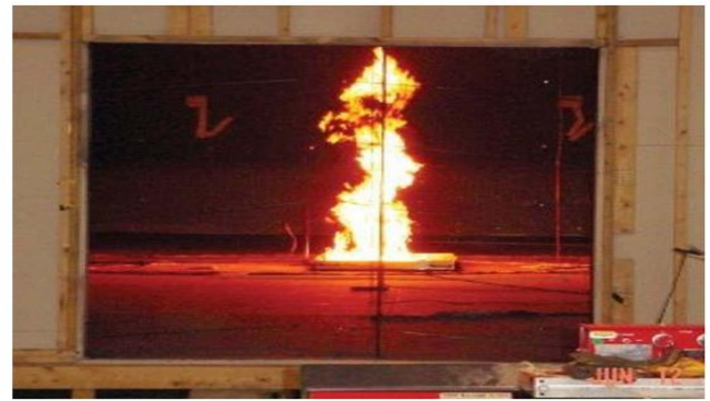
Figure 4 Large-scale fire test performed by NIST as part of a fire model validation project

For such fire tests to be used for comparison, they must be thoroughly prepared and performed. After successful completion of the fire test, the results and all observed phenomena shall be carefully documented so that they can be archived for later use. The results of fire tests are recorded in databases, which do not contain information on the accuracy of the measuring instruments used, etc. One such database is, for example, the FDMS from the National Institute of Standardization and Technology in the USA.