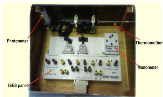
Figure 5 Experimental arrangement of the remote experiment “Weather monitoring“ in Trnava, utilising an ISES set, www.ises.info

remote experiments and the server-client connection was modular ISES WEB Control software. The thermometer is protuberant form the window for about 20 cm (Fig. 6), the manometer is located inside the laboratory and the photometer is focused horizontally to the sky. In fact, the photometer is not a heliograph, as it does not collect sunshine from the whole hemisphere. The thermometer is partly shielded from the direct solar radiation.