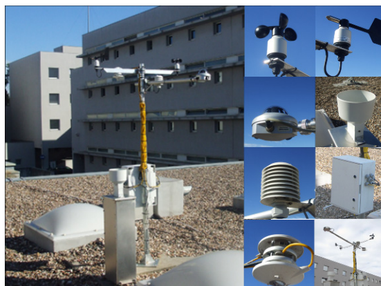
Figure 4 Weather station at the Faculty of Engineering, University of Porto [6]

Description of equipment: The weather station at the Faculty of Engineering University of Porto (FEUP) (Fig. 4) comprises an anemometer, a wind rose, pyranometer for measuring solar radiation, rain gauge, sensors for measuring relative air humidity, temperature and atmospheric pressure, and pyrgeometer for measuring the atmospheric infra-red radiation spectrum.