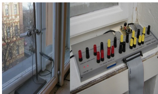
Figure 6 Experimental arrangement of the remote experiment “Weather station“ in Prague, utilising an ISES set, www.ises.info