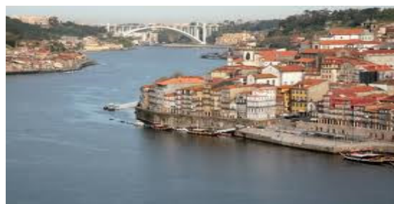
Figure 3 Porto [4]

Read the project assignments carefully, and then start working. Work out the project on the basis of the knowledge acquired from textbooks, journals, encyclopaedias and consultations with teacher or other experts.