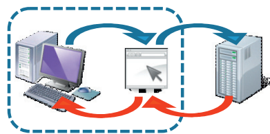
Fig. 1. Proxy Server communication.

After starting function main() it is opened socket accepting new connections and its launched the loop containing blocked waiting for the new arrival communication. New incoming communication is checked if it is not exceed the maximum limit of connections, and if not, new thread is created with an entry point handleClient() and the new socket is created. Otherwise, the main thread waits to releasing a free thread. It is also updated counter of free threads.